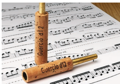
Writing on cork