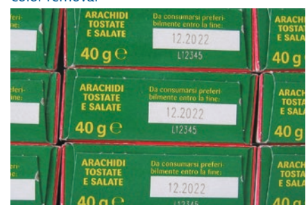
Writing on cardboard boxes