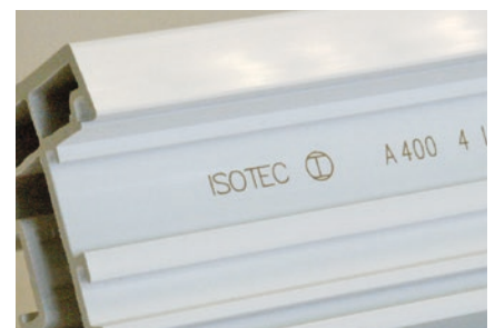
Marking of plastics