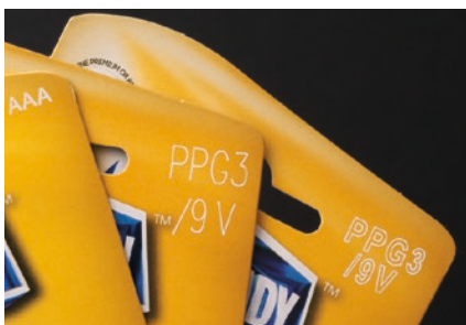
Writing on card