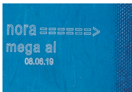
Marking of composite materials