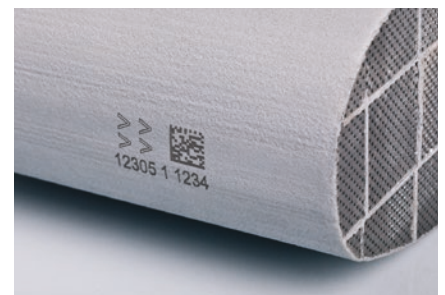
2D Code marking of soot particle filters