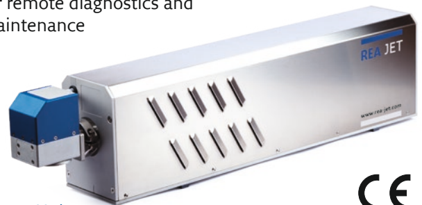
CL Laser Unit