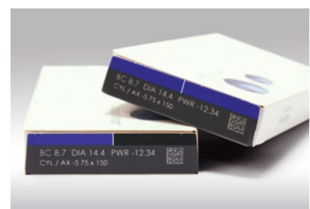
Coding and marking of packaging through color removal