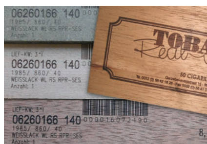
Marking of wooden profiles