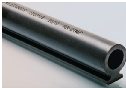
Marking of rubber profiles