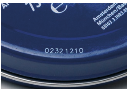
Writing on painted tins

The REA JET TITAN Platform. The single operating concept for all REA JET technologies.