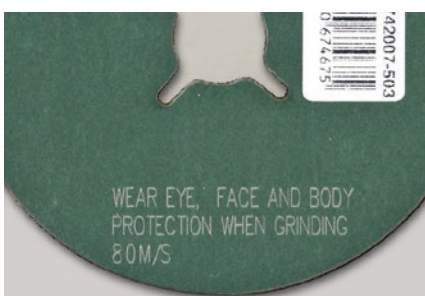
Writing on sanding discs