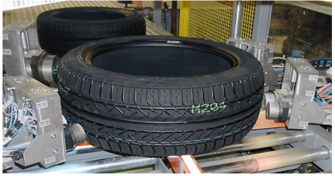
Colored stripe marking of finished tire