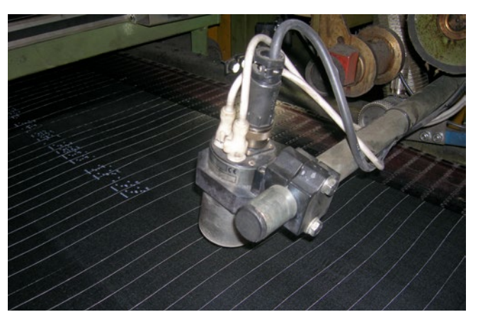
Alphanumeric productcode on texture cord

To improve quality, the tracking of components throughout the whole production process is becoming more and more important. 2D codes are able to accomodate a much larger amount of data in a small space than plain text and can be applied at many stages of the production process. Both raw rubber and on vulcanized products.