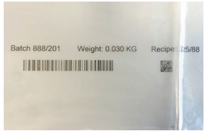
Alphanumeric marking, 2D code and barcode on EVA bags