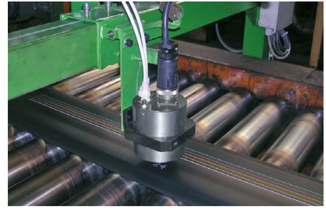
Alphanumeric marking on raw rubber tread