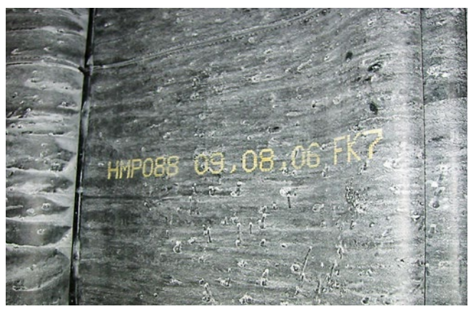
Production code applied to rubber compound