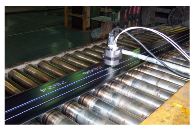
Alphanumeric printing on tire tread