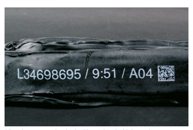
2D code on non-vulcanized rubber, printed with large character ink jet system