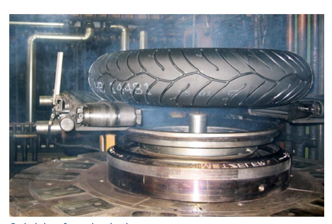
Coded tire after vulcanization