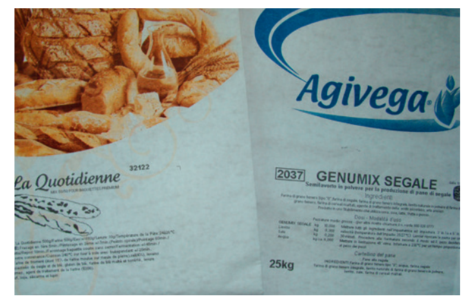
GK 2.0 - Detailed description on paper bags