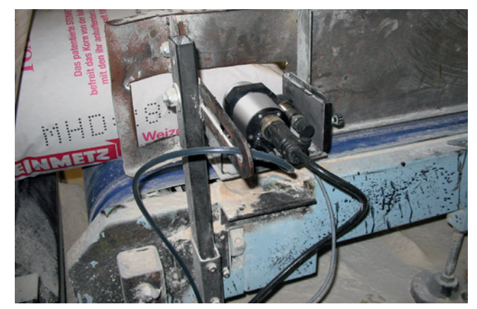
Sidewise best-before-date marking with DOD