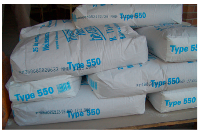
DOD marking of filled flour bags