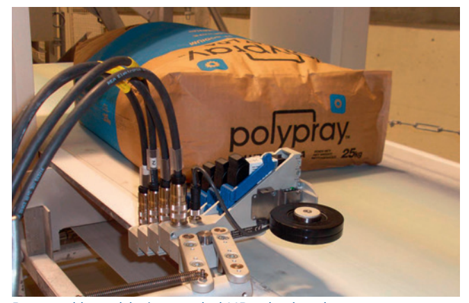
Bag marking with 4 cascaded HR print heads