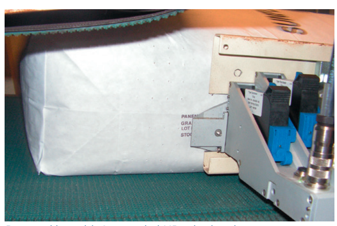
Bag marking with 2 cascaded HR print heads