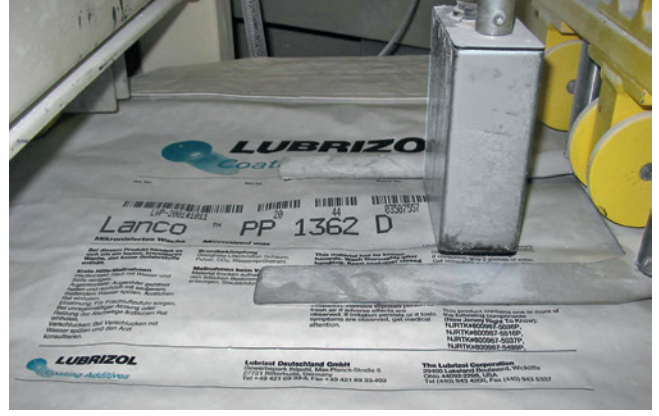
Marking paper bags with GK 2.0