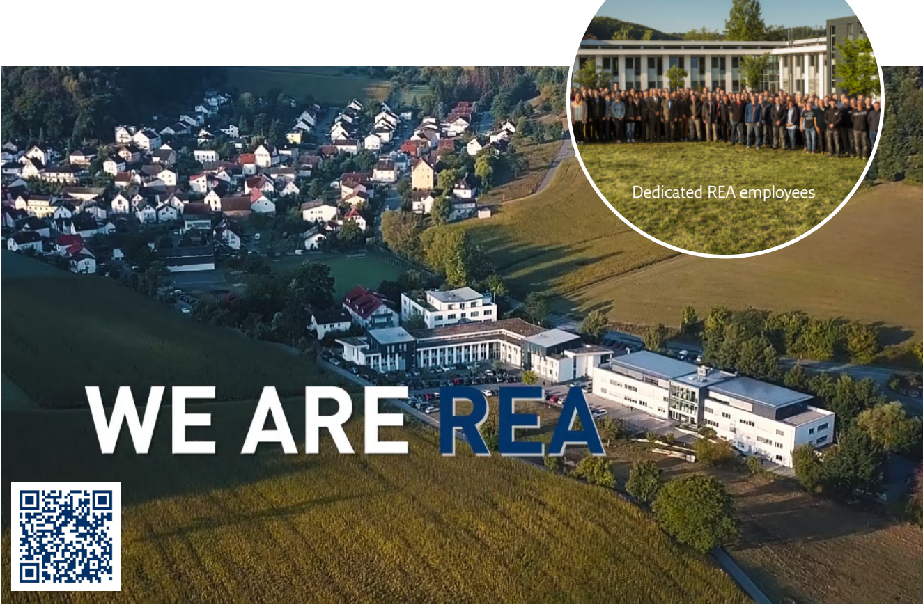
REA Headquarters, near Frankfurt am Main/Germany